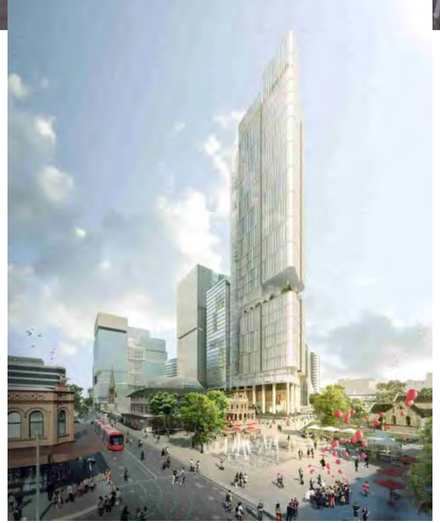
PSQ 4 & 6 (Picture above) - 4-6 Parramatta Square The first tower being built, 4 Parramatta Square is expected to be completed in mid-2019, while 6 Parramatta Square will be ready for occupants in 2020.